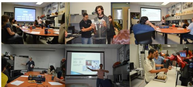
Figure 4. Selected pictures from technical seminars conducted by senior students

After the successful completion of the advanced project, some of the lead students proposed their research projects to other lab students as well as faculty advisors in Discovery Lab. Through rigorous discussion and thoughtful evaluation process, we selected the outstanding proposals submitted by lab students. Each project leader recruited their team members, organized their teams, and trained their teams for their project requirements. Senior students who had research experience under the TeleBot project, presented many technical seminars during their projects. Figure 4 shows selected pictures from some of the technical seminars.