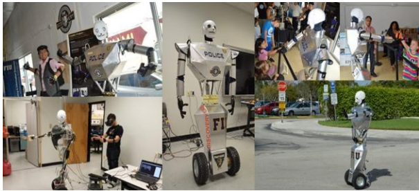
Figure 3. Selected pictures from field demonstrations of the TeleBot at different outreach activities

After completing their projects, they joined an advanced and large scale project, the TeleBot Project [9,10,11,12,25], and collaborated with other teams. Each team has its own team goal that is part of the final goal of the project. During this TeleBot project, students involved in many outreach activities for exhibiting their team contributions on the TeleBot and demonstrated TeleBot operations to the public as shown in Figure 3.