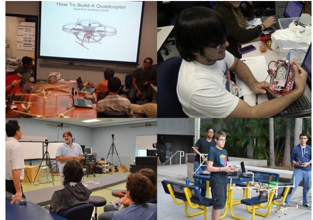
Figure 1. Selected pictures from the Discovery Lab DIY Workshops.

Some research findings [19,20,21] of the successful projects were published and presented at Florida Conference on Recent Advances in Robotics (FCRAR - 2012). Figure 2 shows three project posters used at the conference. Later, one of the outcomes of those projects, Air Aquarium [19], was filed in the United States Patent and Trademark Office on April 29, 2015 (US 14/699,526) for a patent [22].