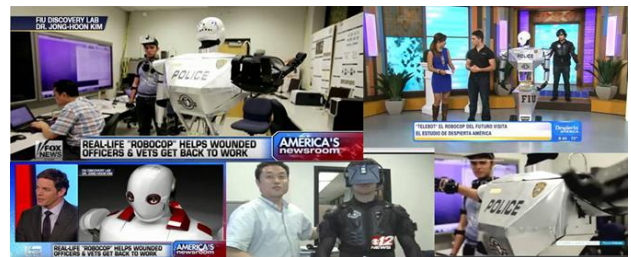
Figure 6. Pictures from some selected press coverages of the TeleBot project

In the third stage, fourteen students participated in the TeleBot project as core developers and successfully finished the first phase of the TeleBot project. During this phase, the TeleBot project had more than 400 international press coverages from all around the world including Yahoo News, MSNBC, Fox News, etc. [27] (Figure 6).