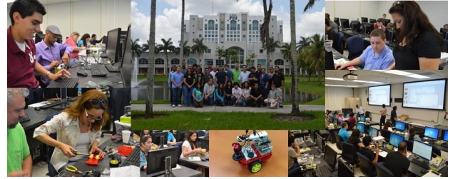
Figure 5. Selected pictures from Google CS4HS workshop

received compliments from the workshop attendees as well as their mentees.