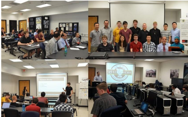
Figure 7. Selected pictures from the REU program for the academic year 2013 and 2014

In the last stage, three selected projects were conducted by student leaders, and the results were published in the proceedings of the three international conferences [7, 23, 24, 26] and one journal. Five selected students admitted to NSF REU program at FIU. Out of the contributed three projects, REU program at FIU selected the project “Smart Prosthetic Arm” as one of the best project (Figure 7).